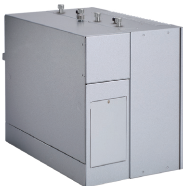
▲ Rear view