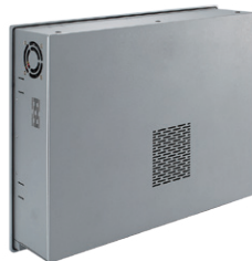
▲ Back view