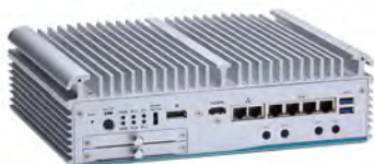
eBOX671-521-FL with 4 CH-PoE and MXM graphics module

Take, for instance, eBOX671-521-FL , a fanless embedded system that provides reliable high-speed connectivity for on-premise and cloud servers to host industrial machine vision systems on the fly. The embedded system is purpose-built for smart factory applications. It offers abundant I/O connectivity options for multi-camera imaging applications as well as display interfaces including DVI-I, HDMI and DisplayPort.