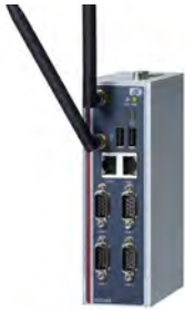
Robust DIN-rail, Intel® Atom™ embedded system, The ICO300-MI

Axiomtek also offers embedded IoT gateway platforms like ICO300-MI targeted at industrial applications such as smart factory automation, smart energy, facility monitoring systems and more.