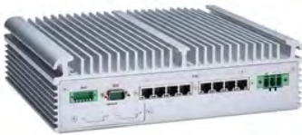
Another embedded system in the eBOX series, eBOX671-517-FL with 8 CH-PoE/GbE onboard

most important building block supporting these emerging technologies is industrial computer hardware. Industrial computers are now evolving with these new automation trends. Some are offering features and functionalities that incorporate key requirements for successful deployment of AI, machine vision and digital twin platforms.