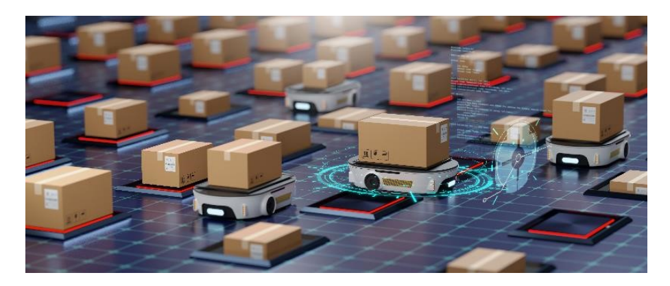
eBOX565-52R-FL – Wide DC input, Compact Scalable Computer for Fulfillment Robotics, Forklift Control and Collaborative Robot Uses

This compact embedded system is designed for space-constrained applications in Back of House, warehouse or factory uses. It has been integrated to control autonomous warehouse robot and other machine automation applications, including collaborative robots, automated grocery picking and smart warehouse goods transport. With its wide power input range and good vibration and shock resistance, it can be used for onboard vehicle applications including forklift control. Some key features are listed below.